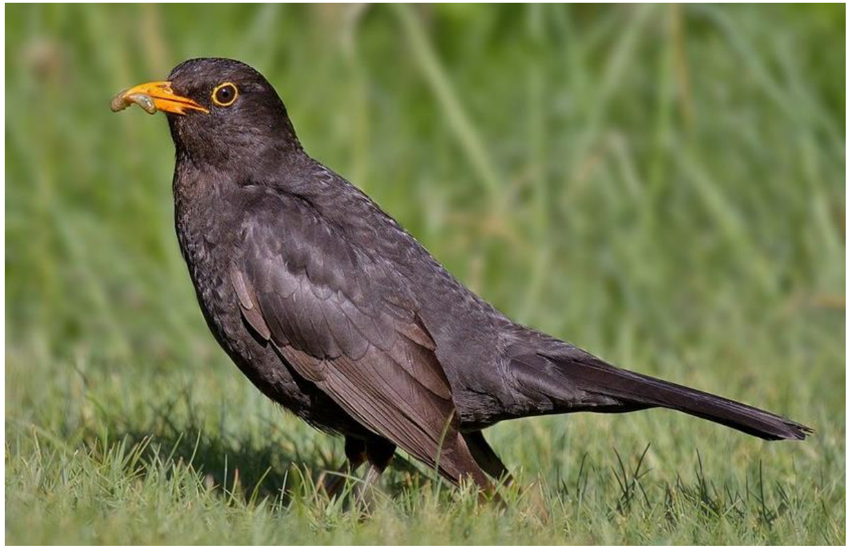
Common blackbird, © Andreas Trepte, CC BY SA 2.5

Birds such as gulls and blackbirds have developed such a diverse diet that they can inhabit a wide range of environments. The blackbird is a recent immigrant with a variety of adaptations that suit it to a wide range of environments. It can be found in places as diverse as towns, cities, orchards, farms and remote forests, from the sea to mountaintops.