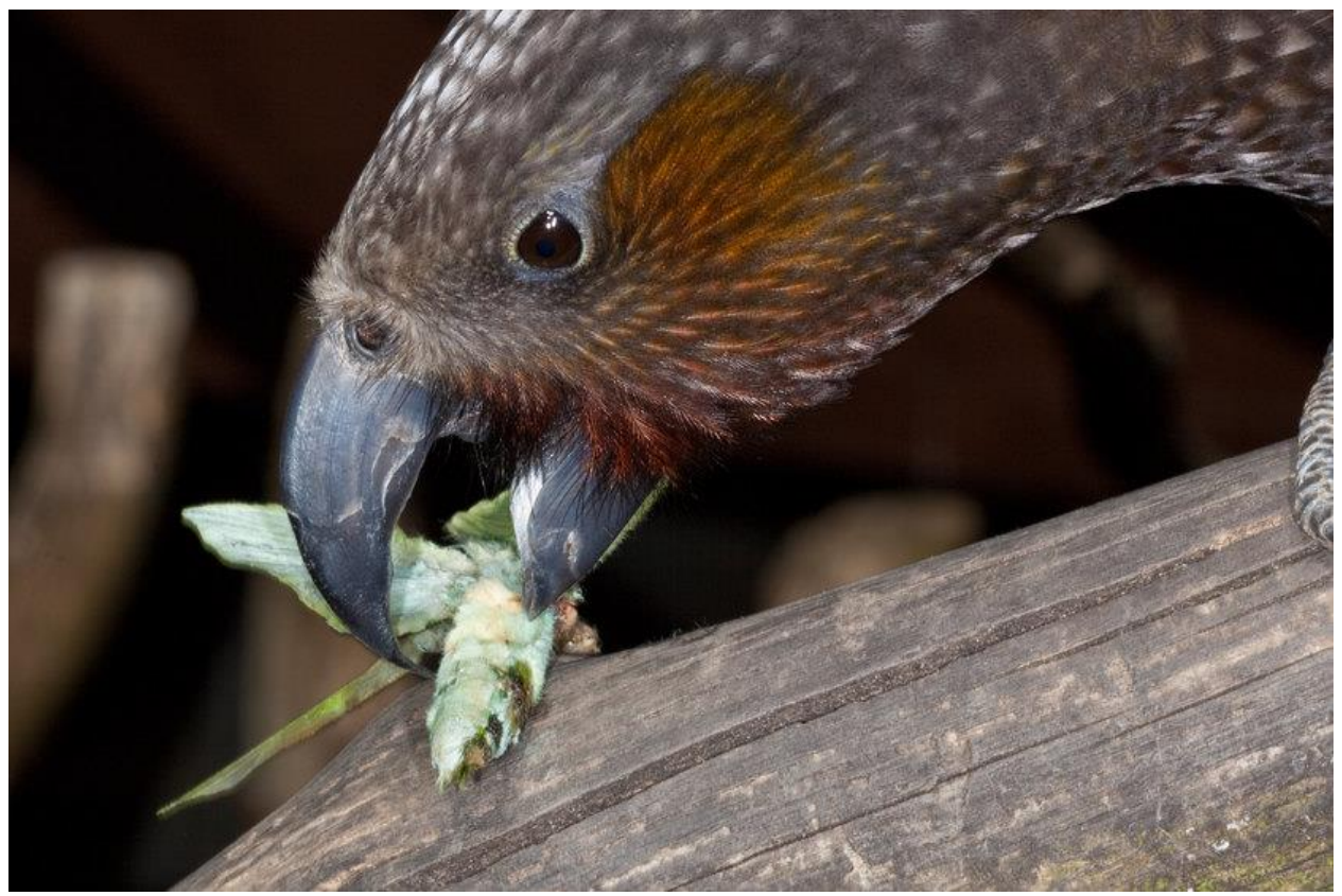
Kākā eating a pūriri moth, image courtesy of Ngā Manu Images

Birds have a range of easily observable structural and behavioural adaptations that give clues to their different foods and lifestyles.