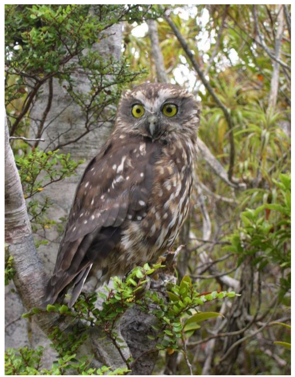
Mosborne01 Public domain

Adaptations change slowly and only over many, many generations. For some native birds, their adaptations actually threaten the birds' survival. Many New Zealand birds are flightless, and that combined with their slow breeding rates, small clutch sizes and large eggs are some of the factors that affect their survival. These flightless birds and large eggs are easy prey for predators. Many of New Zealand's nocturnal birds will not thrive in brightly lit urban environments.