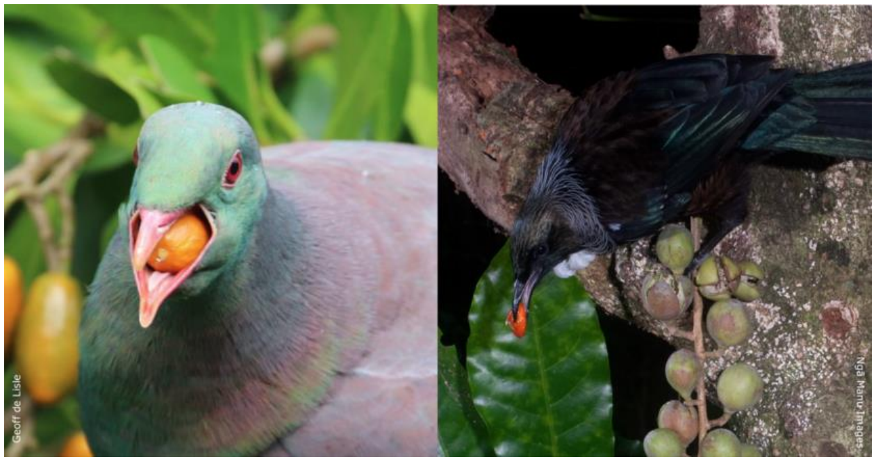
Kererū, © Geoff de Lisle. Tūī, courtesy of Ngā Manu Images

Different bird species can occupy the same habitat without competing for food because of their different feeding structures