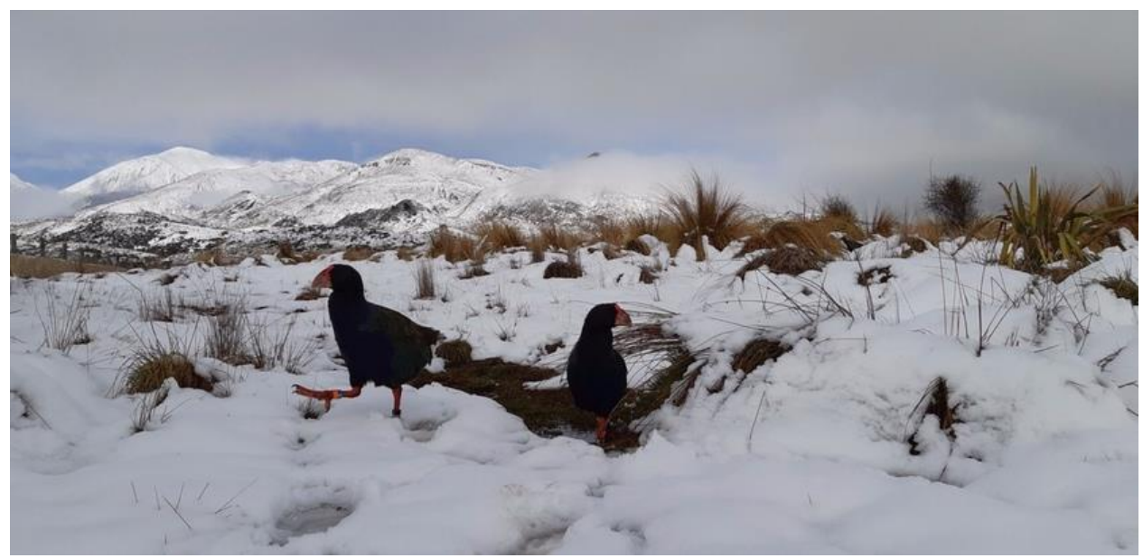
Takahē in Fiordland

The fantail – with its varied diet of flying insects, its treetop nests, and its acrobatic flying skills – has adapted to survive in the presence of people.