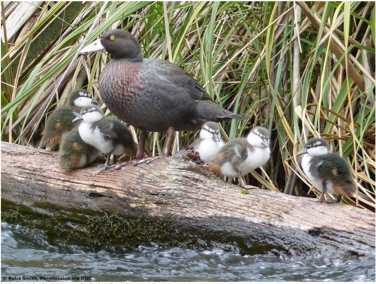
Whio with ducklings, © Bubs Smith

These are the basic structures that define these animals as birds.